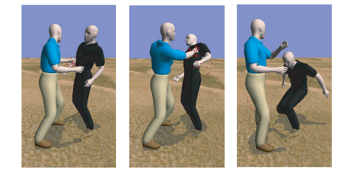
Figure 1: The middleware provides dynamic motion control in response to physical interaction between the character and environments.

The controller in the middleware consists of three components; motion synthesizer, dynamic controller, and reaction generator. The motion synthesizer realizes smooth transition from one action to the following action considering the constraints of the end-effectors even when the character posture is slightly changed by external interaction. The dynamic controller then computes output angular accelerations for all joints based on the synthesized motion. It realizes human-like dynamic control in response to its balance and joint stresses of the character. For example, it moves the pelvis to keep its balance or swings the arms to reduce the stresses on the back or legs. Our dynamic control method is specified to humanlike articulated figures and it controls each body part through a minimum number of degrees-of-freedom. The reaction generator produces dynamic reactions such as protective step for balancing, falling down and recovery motion. The reaction generator works when the dynamic controller cannot handle too large external influence. More details about the dynamic control techniques are found in [Oshita and Makinouchi 2001].